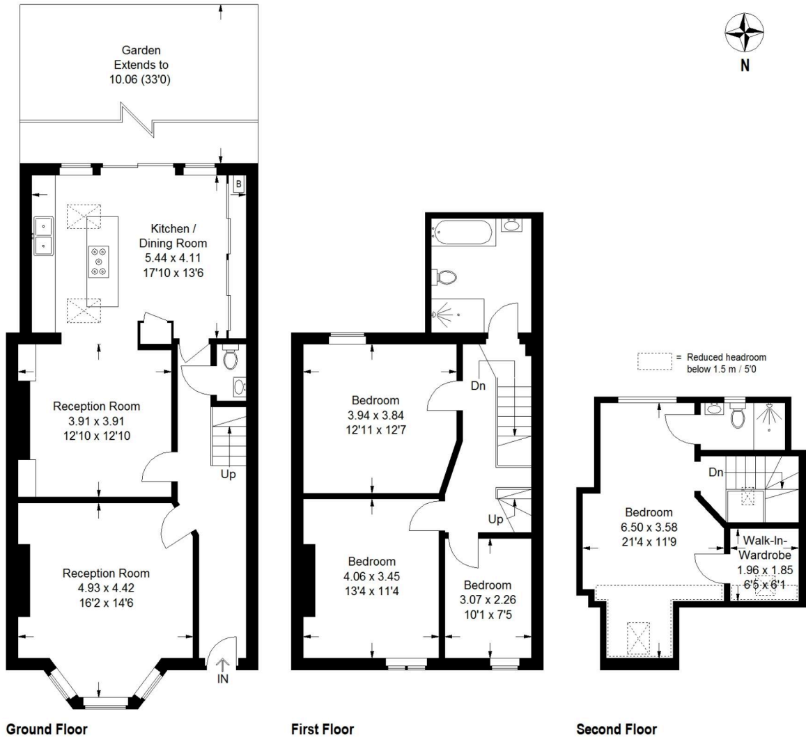
Illustration for identification purposes only, measurements are approximate. Drawn for Pickwick Estates.

Approximate Gross Internal Area = 155.7 sq m / 1676 sq ft