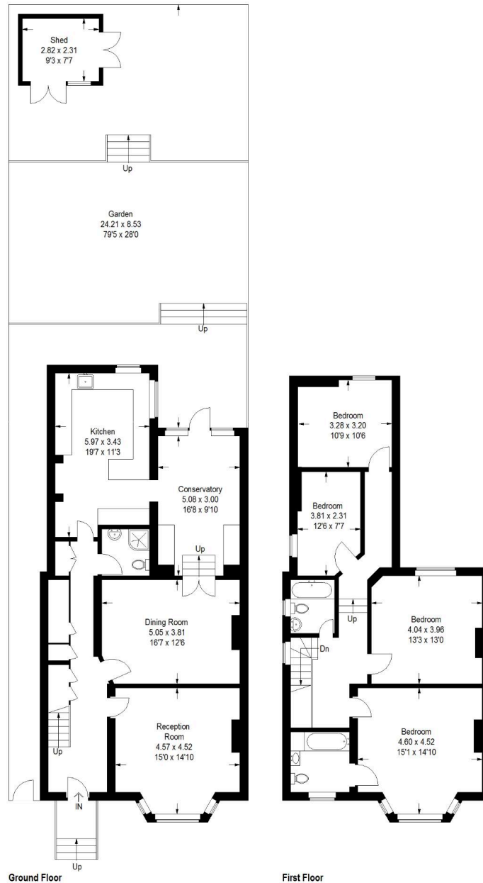
Illustration for identification purposes only, measurements are approximate. Drawn for Pickwick Estates.